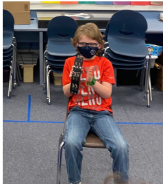
3rd Graders playing sixteenth notes on an instrument.