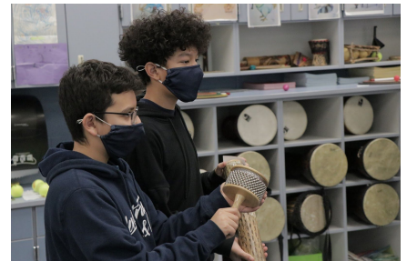
6th Graders exploring sound effects as we prepare to create a sound story.

Our music room recently received a grant from the PCSD Foundation. We were able to purchase some new instruments, as well as multicultural story books so that our 6th graders can create some original sound stories. Find out more here: