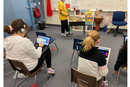
6th Graders using their computers to play a song with an online xylphone.