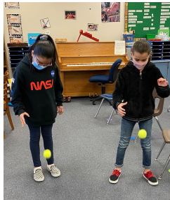
4th Graders demonstrating the strong and weak beats with tennis balls.