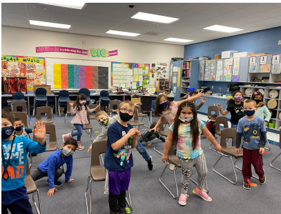
Kindergartners exploring high/medium/low sounds and shapes.

Here are few highlights of the things the students have been learning in music recently. We have been working on laying the foundation for understanding beat, rhythm, and melody while also discovering music from many cultures around the world.